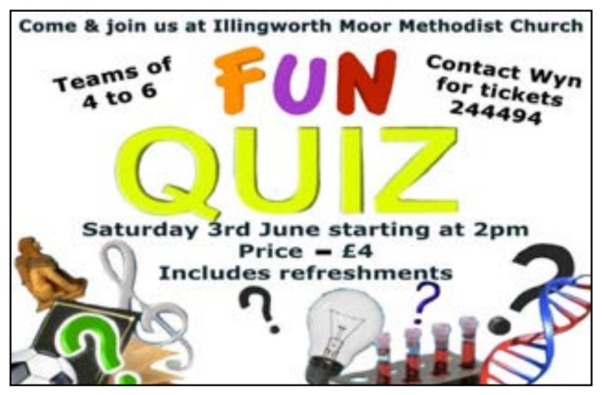
If you only want one or two tickets that's ok. You can make up a team when you arrive. No problem.