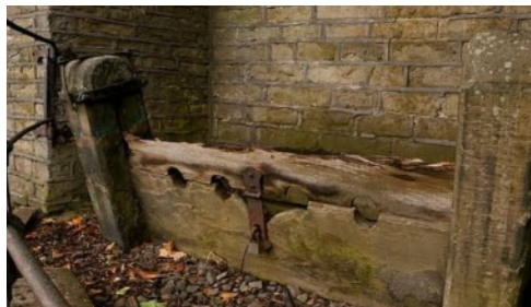
Illingworth Stocks, Wrigley Hill

On Wednesday, during a pelting rain storm, one of the Ovenden roughs sat in the stocks three hours for Sunday Gambling and yesterday, Friday, a second paid a similar penalty for a like offence. A much heavier penalty is necessary to put a stop to this practice, which is very prevalent in this district on Sundays. When they are taken in the act by an Officer, they often jocosely remark "Oh three hours in the Stocks will settle it".